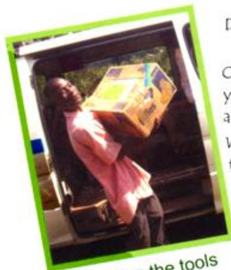
Collecting the tools at KRCDO