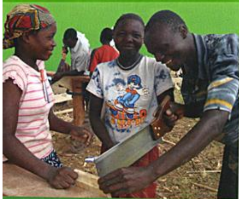
Inspirational gifts to help end poverty